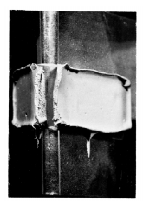
(a) Complete Cracking and Adhesive Failure