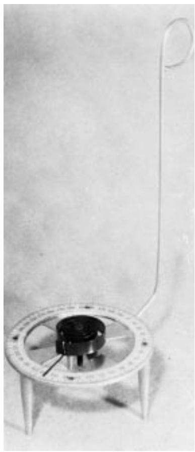
FIG. 1 Spiral Coil

6.4.1 Spiral Coils—The specimen holder for spiral coils shall provide means for securely holding the coil. Although other means of support are possible, the holder or mounting arbor shall be preferably circular cross section whose diameter shall be as large as possible without touching the inner turn of the coil under any conditions of test temperatures. The arbor shall be slotted across its diameter and to a depth greater than the width of the specimen. The width of the slot shall be slightly narrower than the thickness of the specimen so that the inner tab will be a push or snug fit in the slot. The edges of the slot shall be sharp where it intersects the circumference of the arbor. The slot shall be so positioned in the arbor that the center of rotation of the coil and the center of the arbor coincide.