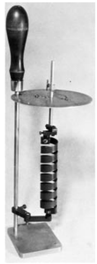
FIG. 3 Helical Coil