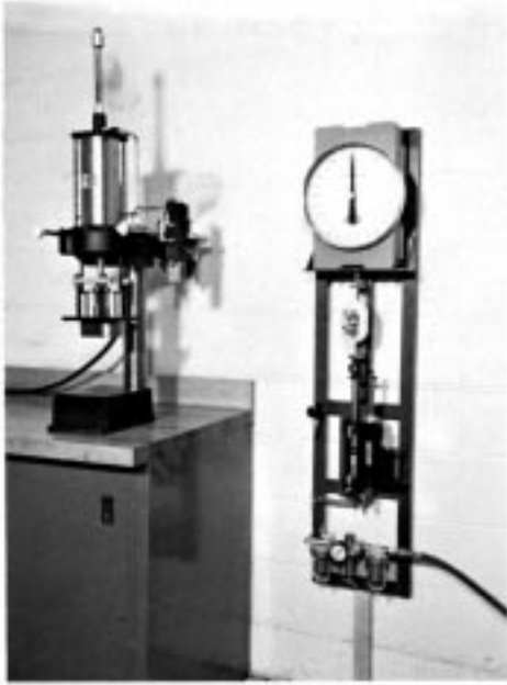
FIG. 1 Tension Test Unit