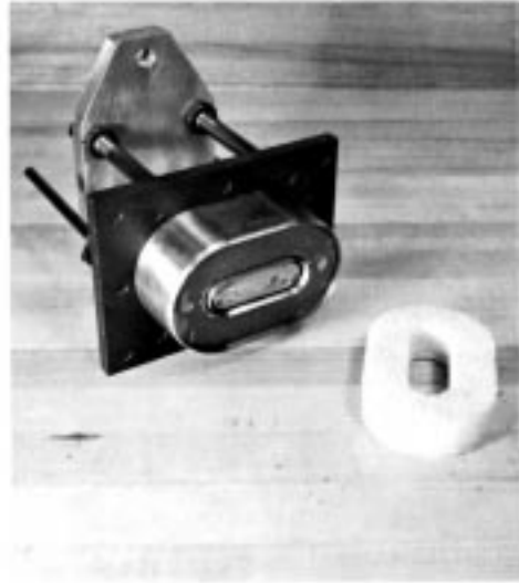
FIG. 3 Specimen Die Cutter