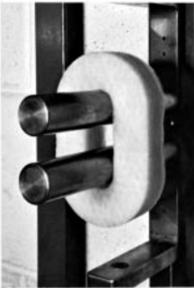
FIG. 2 Post-Type Grips